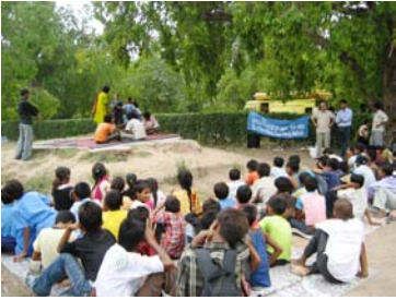
Performances during Cultural Evening

The cultural evening was held at India Gate on 21 st July 2009 in which 125 children were present. The highlight of the event was a play on eve teasing by children from Nizamuddin Dargah which bagged the first prize and a dance performance by girls from Andrews Ganj.